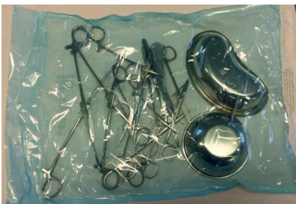
Figure 2: Instruments in sterilization pouch